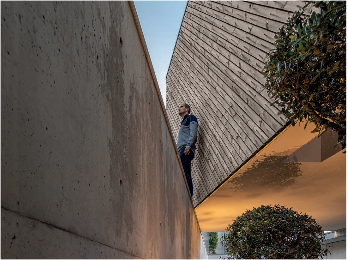
■ Casa A, Portugal, by REM'A arquitectos