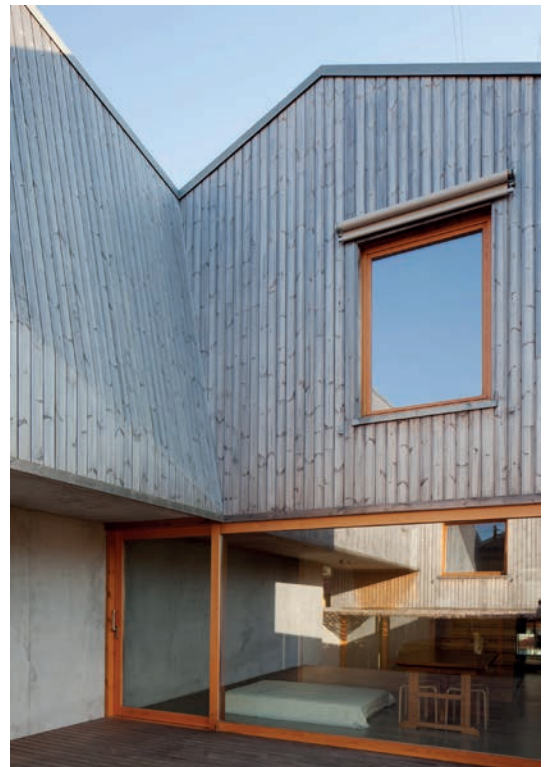
RV House, Portugal, by Marta Rocha and Fabien Vacelet

With Lunawood's tongue and groove products, it is possible to create beautiful wooden surfaces, installed vertically or horizontally. Our wide product range includes sharp-edged and more traditional profiles. The new brushed extra-wide spruce panels provide a more rustic look for facades and interiors.