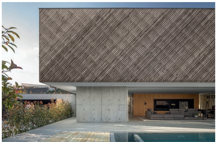
■ Casa A, Portugal, by REM'A arquitectos

Thermal modification gives Lunawood a distinctive, unified brown colour. However, like untreated wood, Lunawood will begin to turn grey gradually, due to the effects of the weather when the surface is left untreated. The final shade of grey varies from pure silver grey to more variegated depending on the UV-radiation and climate. The duration of the greying process also varies and can take years, but the end result is worth it. The greying does not affect the good technical properties of the product, when the product is installed according to the official installation instructions. The weathered Lunawood gives exterior applications an attractive and natural look.