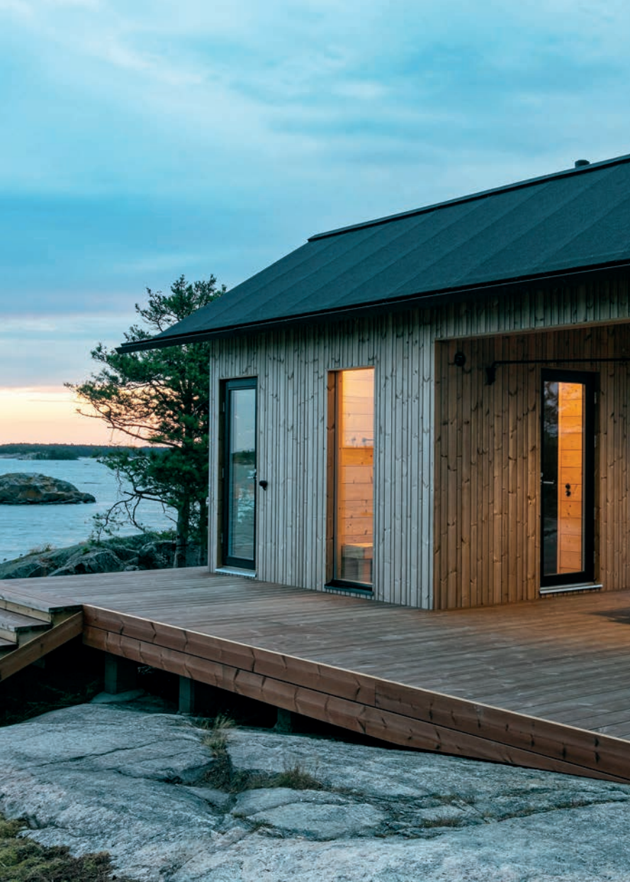
■ Project Ö, Finland, by Alekski Hautamäki